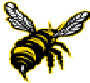
Lew Wallace Hornets