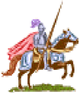
Horace Mann Horsemen